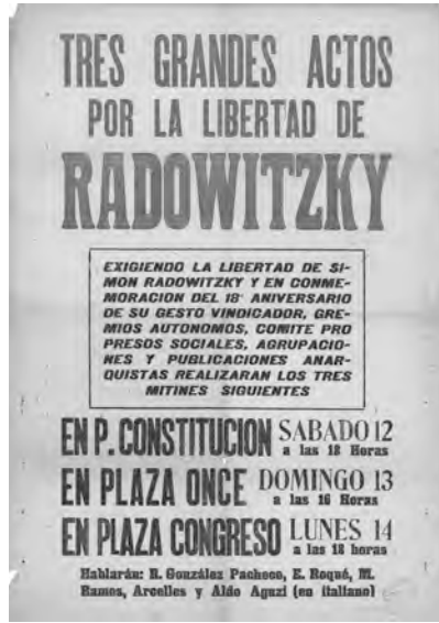
Poster Simón Radowitzky, 1927