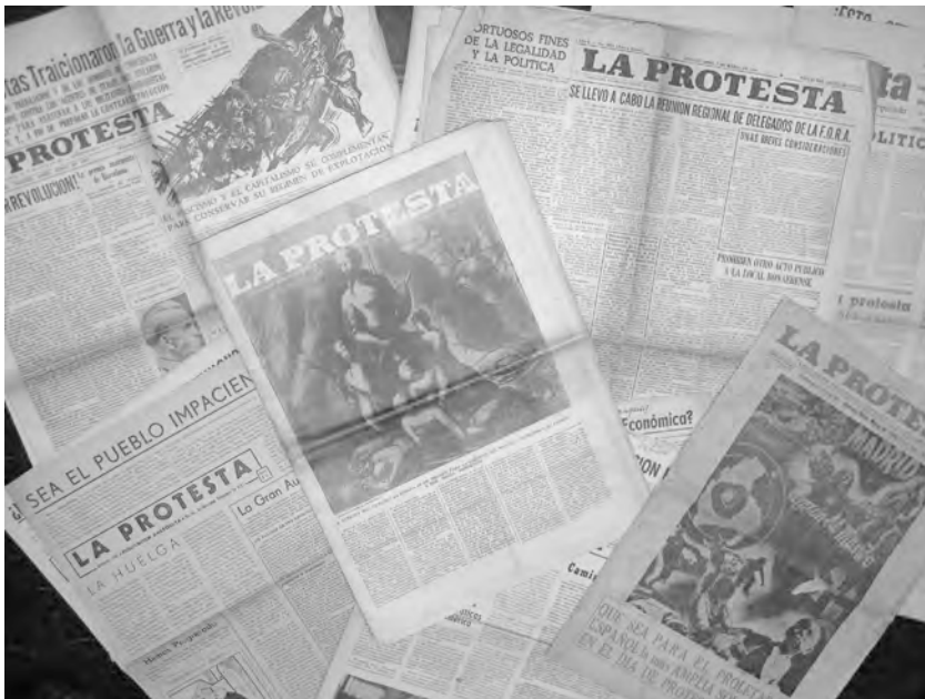
An overview of the collection of 'La Protesta', in the archive of the International Institute for Social History, Amsterdam.