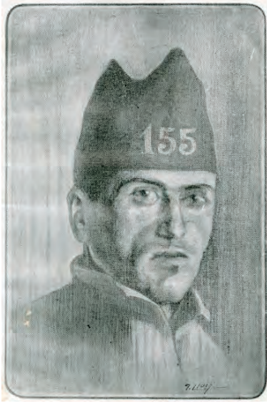
Portrait Simón Radowitzky