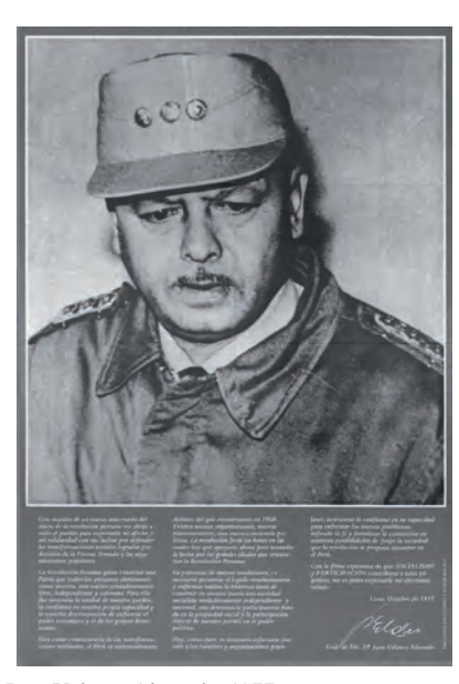
'Tupac Amaru promised it, Velasco accomplished it'.