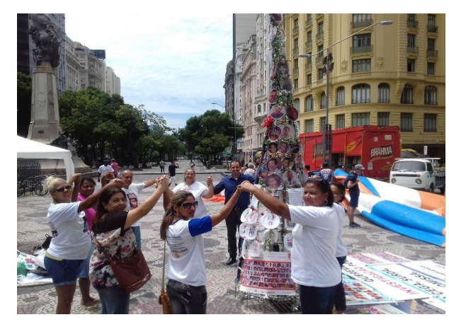
Image 3: Relatives of victims of police violence hold the Christmas tree, Praça Floriano, 16/12/2016.